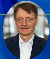
Karl Lauterbach Minister of Health, Germany