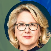
Svenja Schulze Minister of Economic Development and Cooperation, Germany